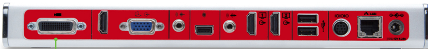
Poly RPG300, RPG500, RPG700 & G7500