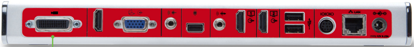
Poly RPG300, RPG500, RPG700 & G7500