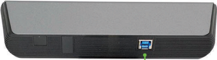
Shown: ClearOne Unite 50

RCC-M004-0.3M USB-A (RCU2-CE™) to USB-B [5VDC] If USB is sole connection between the camera and RCU2-CE™, then up to 1.2 Amperes/6 Watts is supported.