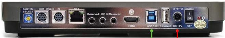
Shown: ClearOne Unite 200