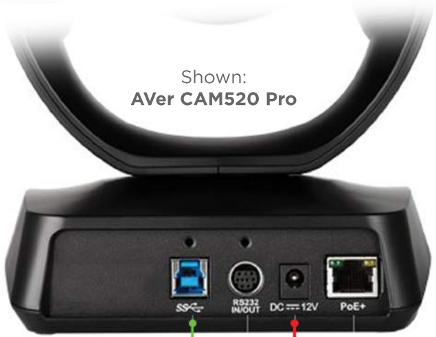
Shown: AVer CAM520 Pro