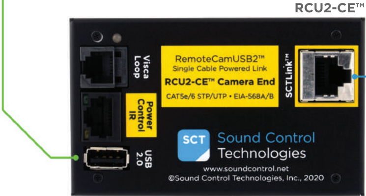
RCC-M005-0.3M USB-A (RCU2-CE™) to USB-C