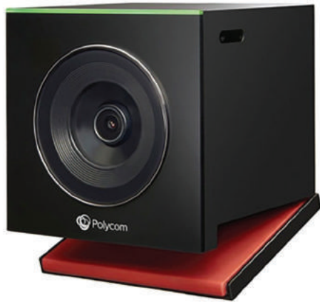
Poly EagleEye Cube