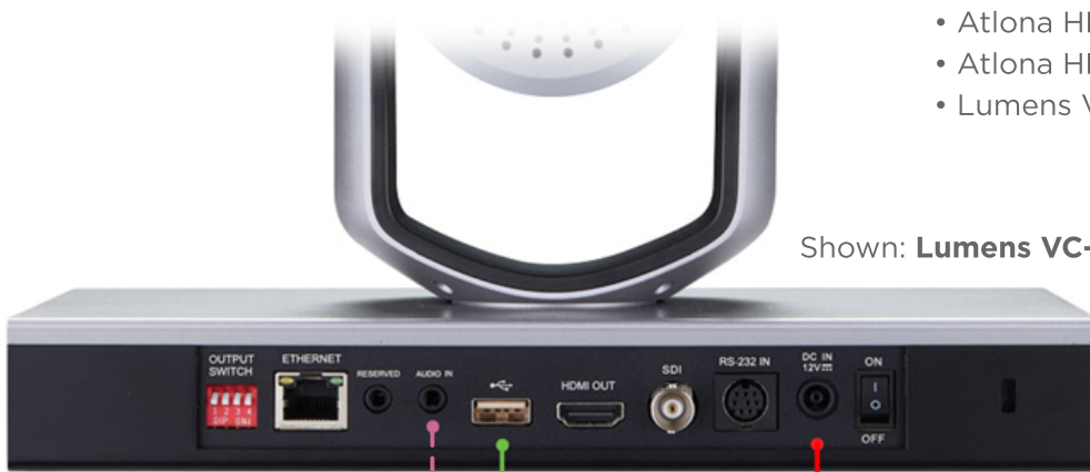
Shown: Lumens VC-TR1