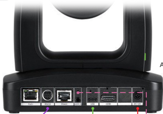
Aver TR311HN & TR331