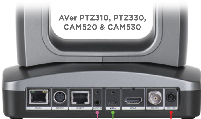
AVer PTZ310, PTZ330, CAM520 & CAM530