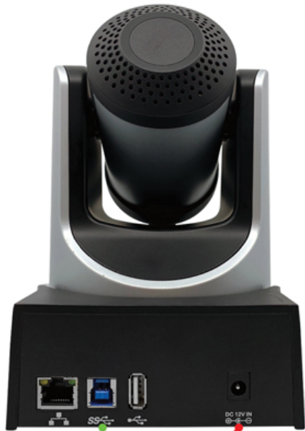
Poly EagleEyeIV USB

PPC-013-0.4M RJ11 (RCU2S-CE™) to right angle 5.5 x 2.5mm COAX (Center Negative COAX)