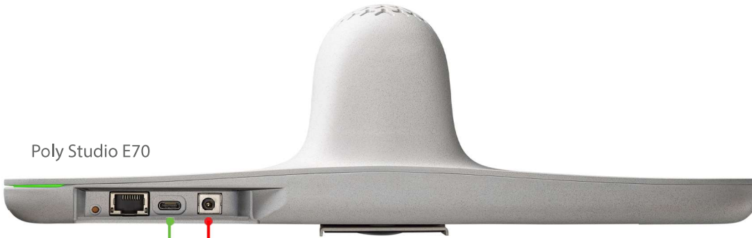
Poly Studio E70

RCC-M005-0.3M USB-A (RCU2S-CE™) to USB-C