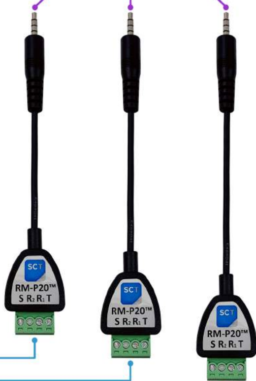
Female TRRS to 4pin Phoenix

CAT5e up to 100 ft or Belden 8406 (or equal) up to 300 ft