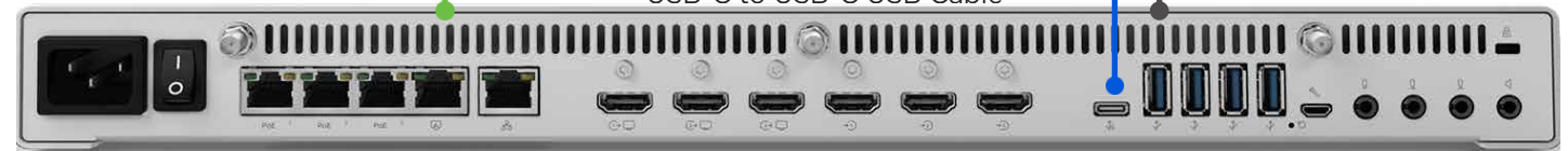
Cisco Codec EQ, Room Bar & Room Bar Pro

Note: DIP switch position 1 on the Receiver must be in the on position to enable Cisco communications.