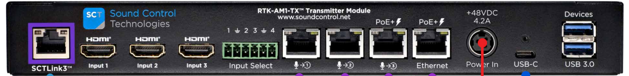
RTK-AM1™ Transmitter Module