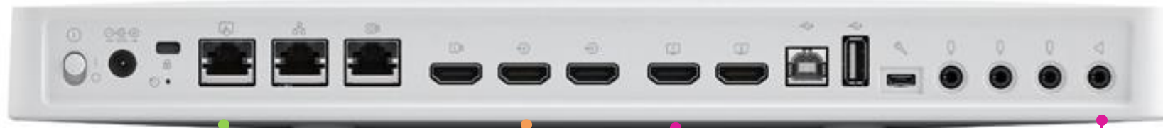
Cisco Codec Plus

RCC-M005-0.3M USB-A (RTK-MINI-RX™) to USB-C (Capture Device)