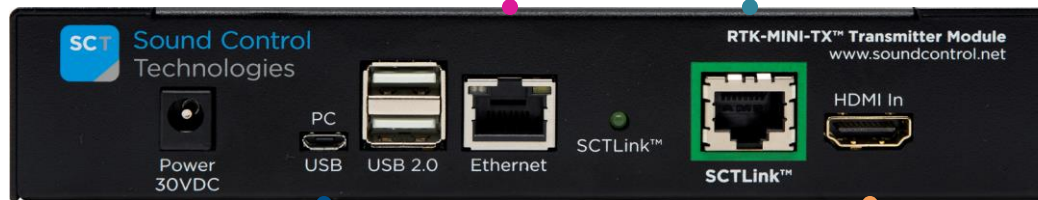
RTK-MINI-TX™ Transmitter Module