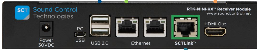
RTK-MINI-RX™ Receiver Module

SCTLink™ Cable Ethernet/POE | HDMI | USB