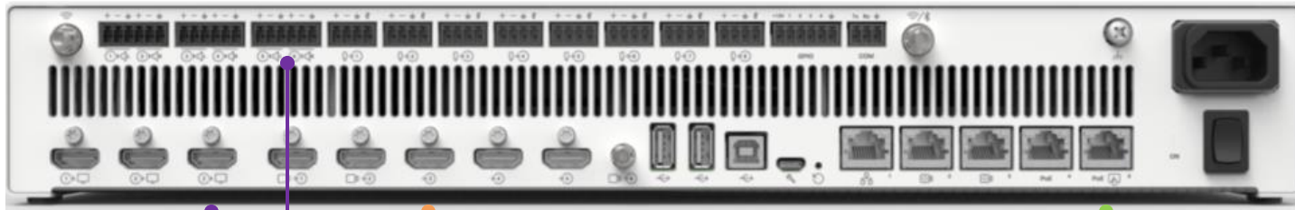
Cisco Codec Pro

RCC-M005-0.3M USB-A (RTK-MINI-RX™) to USB-C (Capture Device)