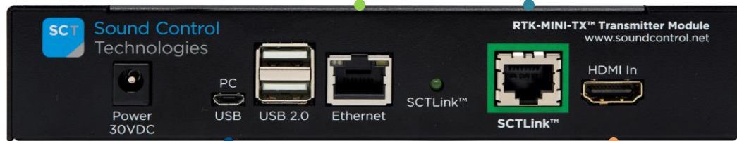
RTK-MINI-TX™ Transmitter Module

RCC-M006-1.0M USB Micro-B (RTK-MINI-TX™) to USB-A