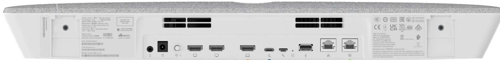
Cisco Room Bar