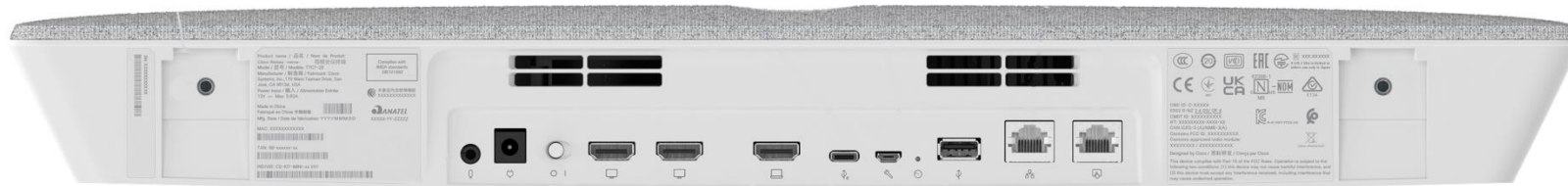
Cisco Room Bar