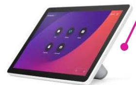
Cisco Navigator or Touch 10