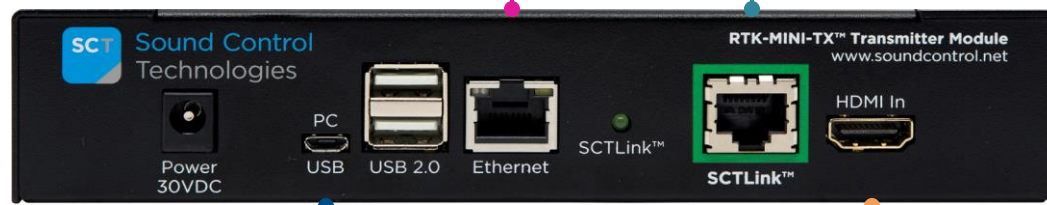
RTK-MINI-TX™ Transmitter Module