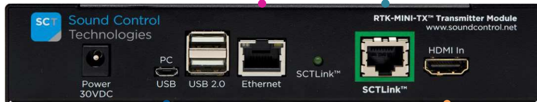
RTK-MINI-TX™ Transmitter Module