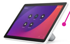
Cisco Navigator or Touch 10