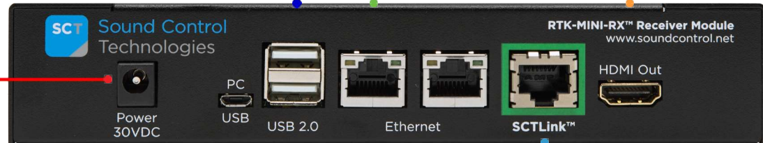
RTK-MINI-RX™ Receiver Module

*Can be used on Tx or Rx.* WPS-12 30VDC 100-240V 47-63Hz Power Supply