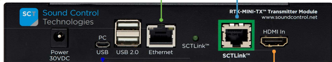
RTK-MINI-TX™ Transmitter Module

RCC-M006-1.0M USB Micro B (RTK-MINI-TX™) to USB-A