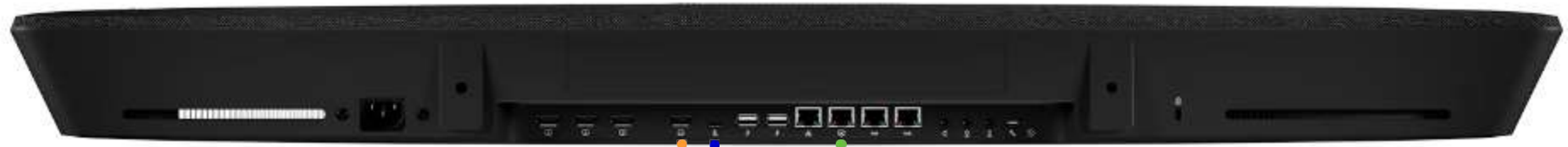
Cisco Room Bar Pro

RCC-M005-1.0M USB-A (RTK-MINI-RX™) to USB-C