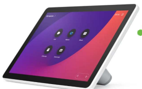
Cisco Navigator Ethernet/POE *Cisco Provided*

RCC-H016-1.0M RJ45 to RJ45 UTP Control Cable