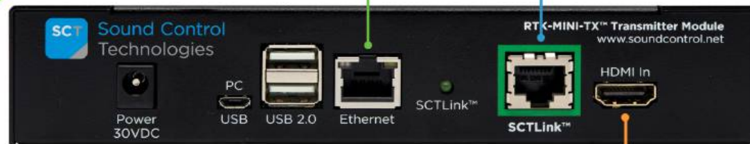
RTK-MINI-TX™ Transmitter Module

Cisco Touch10 Ethernet/POE *Cisco Provided*