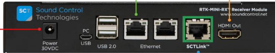
RTK-MINI-RX™ Receiver Module

*Can be used on Tx or Rx.* WPS-12 30VDC 100-240V 47-63Hz Power Supply