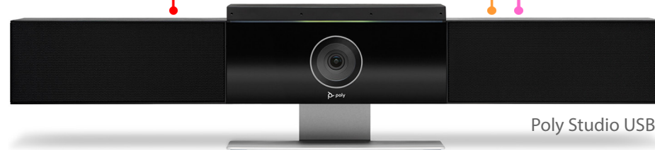
Poly Studio USB Video Bar