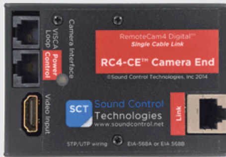
RC4-CE Camera Module