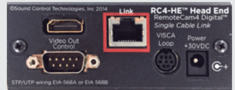
RC4-HE Head-End Module

Dimensions: RC4-HE - 3.75" w x 1.5" H x 3.625" D