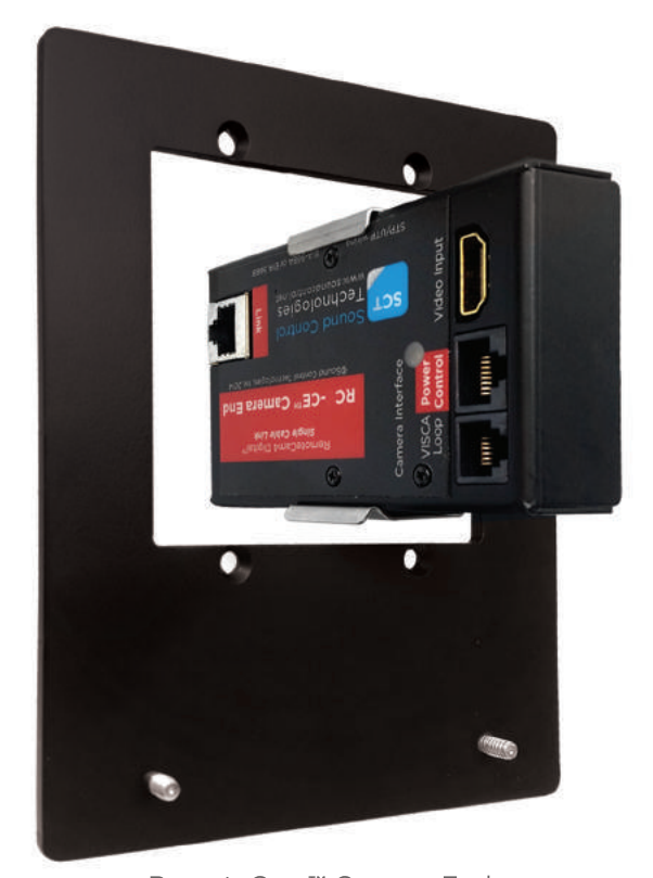
RemoteCam™ Camera End module mounted in the spring clip.