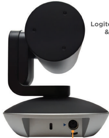
Logitech PTZ PRO 2 & Group Kit