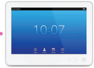
Cisco Touch10 Ethernet/POE *Cisco Provided*