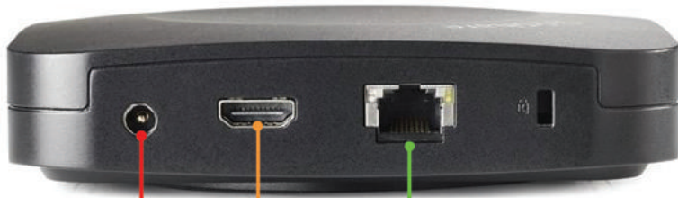
Barco ClickShare CS-100, CSE-200, CX-50, CX-20 & CX-30